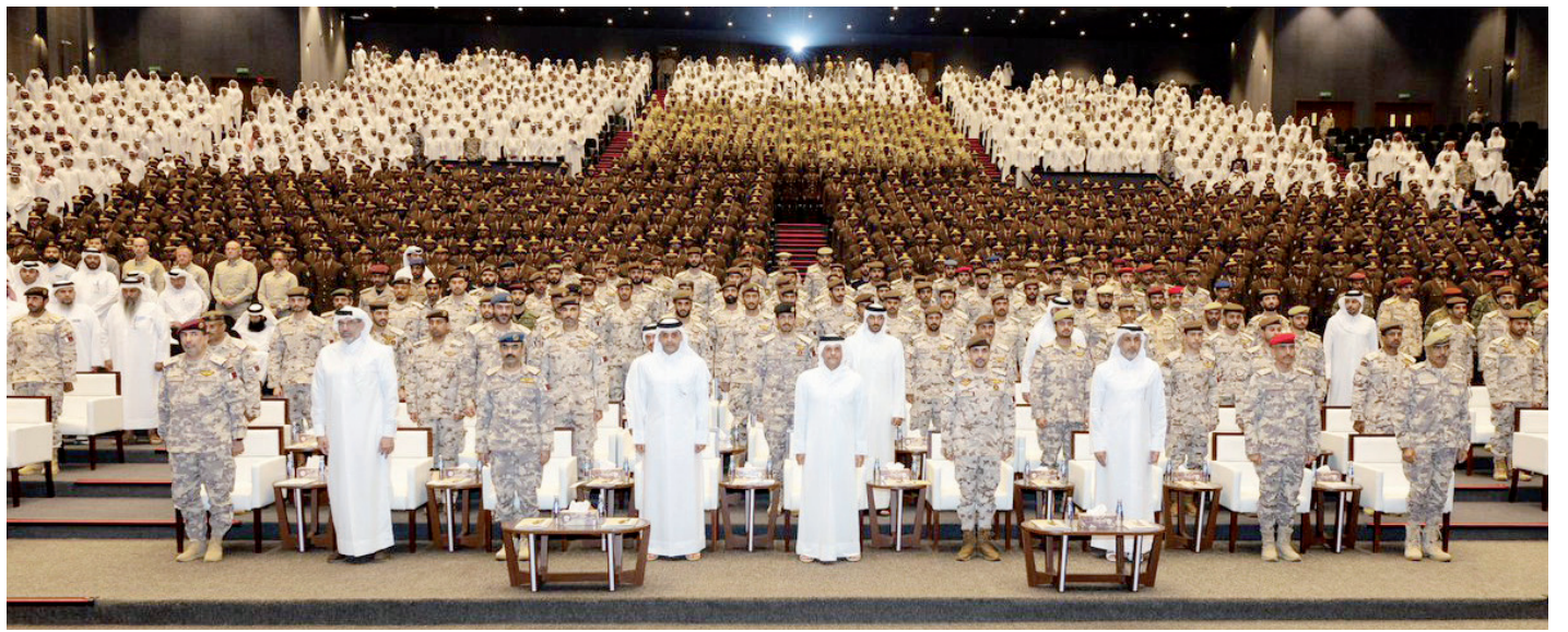
Deputy Prime Minister and Minister of State for Defence Affairs H E Sheikh Saoud bin Abdulrahman bin Hassan Al-Thani with other officials and graduates during the graduation ceremony.

The ceremony was also attended by Minister of Transport H E Sheikh