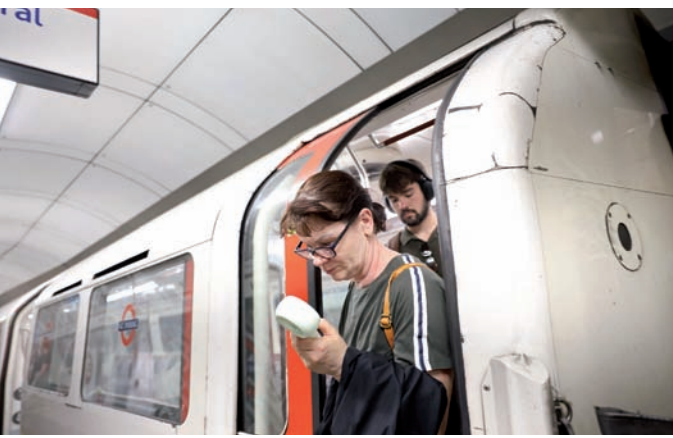
A commuter uses a fan in an attempt to cool down as they exit a London Underground tube carriage, in London, yesterday.

Austria, Poland, Hungary and Croatia each issued heat