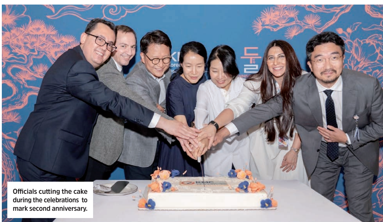
Officials cutting the cake during the celebrations to mark second anniversary.

The Korean Medical Center operates under Apex Health, the fastest-growing health care company in the Middle East and North Africa region. Apex Health manages a network of leading healthcare institutions dedicated to delivering advanced medical services in line with the highest standards, with a strong focus on quality of care and patient experience in Qatar and across the region.