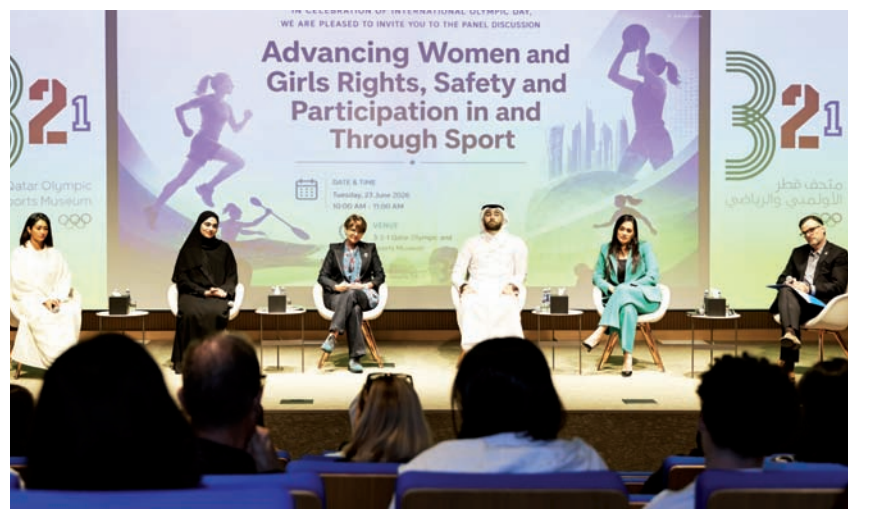
Panellists reflected on the progress made and the ongoing challenges facing women and girls in sport.

not as a pastime at the margins, but as an instrument of human progress." He added that the global conversation on women in sport has evolved significantly. "It is profoundly encouraging to see how far sport has travelled,