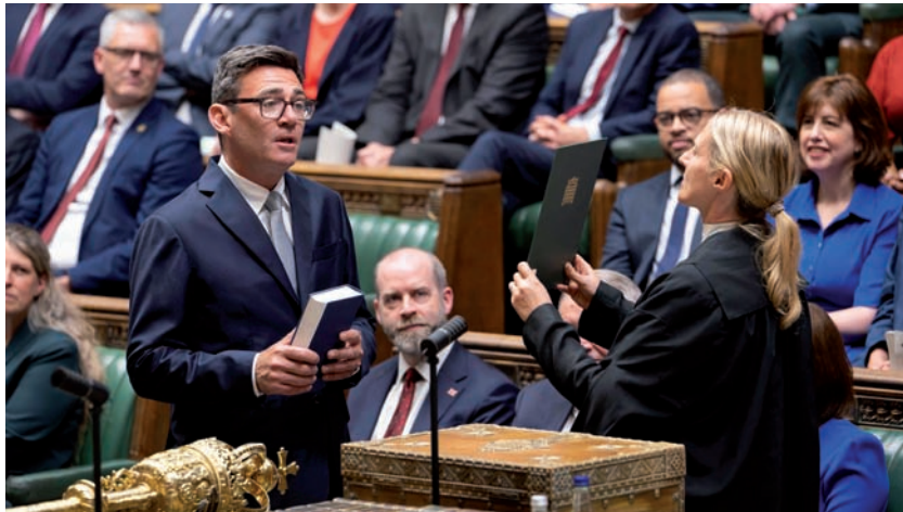
Labour Party MP for Makerfield, Andy Burnham being sworn in after his win in the recent by-election, in the House of Commons in London on May 22, 2026.

Labour veteran Burnham, 56, is the overwhelming favourite to replace Starmer, despite only becoming eligible for the top job after winning a parliamentary by-election last Thursday.