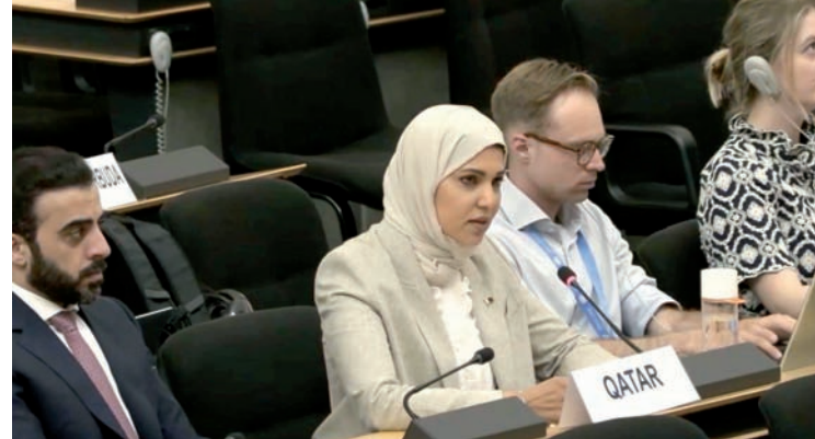
Permanent Representative of the State of Qatar to the UN Office in Geneva, H E Dr. Hind Abdulrahman Al Muftah, speaking during a panel discussion at the 62nd session of the UNHRC in Geneva.

In a statement delivered on behalf of the core group of resolution 59/17 on empowering women and girls in and through sport, which includes the State of Qatar, the Republic of Indonesia, and the Kingdom of Morocco, she underscored the importance of sports as an effective tool to promote human rights, as well as values of tolerance, leadership, and equal opportunities.