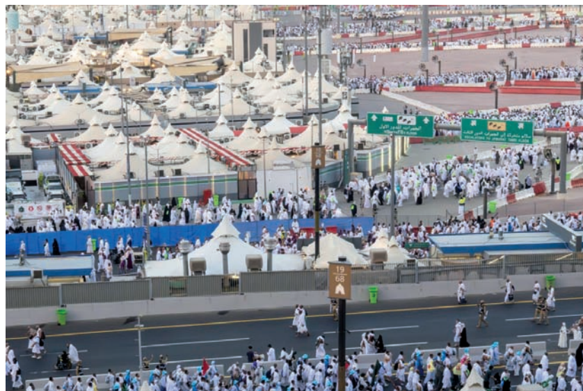
A view of pilgrims in the holy sites during Hajj.

Several pilgrims emphasised that this season represented a significant leap in the quality of services provided to Qatari pilgrims. They praised the advanced facilities in the holy sites, including fully equipped and air-conditioned camps, organised