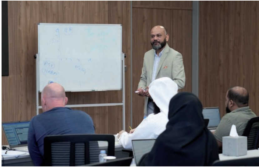
Participants during a specialised training programme.

The National Cyber Security Agency (NCSA), represented by its National Cyber Strategies and Policies Department, organised a specialised training course focused on the implementation of the National Data