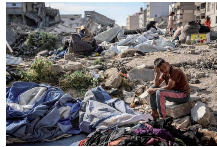
A Palestinian boy sits at the site of an overnight Israeli military strike on structures and tents housing displaced families, in Gaza City on May 28, 2026.

Now "people have been crammed into around 40