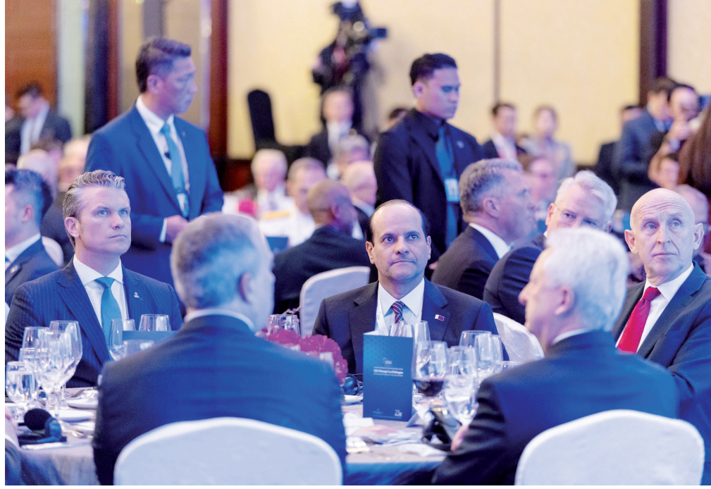
Deputy Prime Minister and Minister of State for Defense Affairs H E Sheikh Saoud bin Abdulrahman Al-Thani attending the ministerial reception for the opening of the twenty-third edition of the Shangri-La Dialogue 2026.

It is noteworthy that the Shangri-La Dialogue this year saw the participation of 41 countries and 22 representatives at the ministerial level, and it is considered a governmental security summit held annually by the International Institute for Strategic Studies, with the participation of prime ministers, defense ministers, senior military leaders, and defense and security policymakers from various countries around the world. — QNA