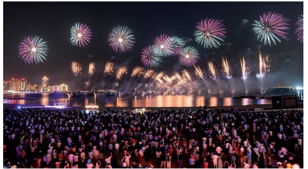
Visitors watch the fireworks display during celebrations at Katara Cultural Village.

The events weren't limited to entertainment alone. Katara offered a comprehensive experience combining leisure and artistic atmosphere through art exhibitions that remained open to the public throughout the Eid holidays, adding an exceptional