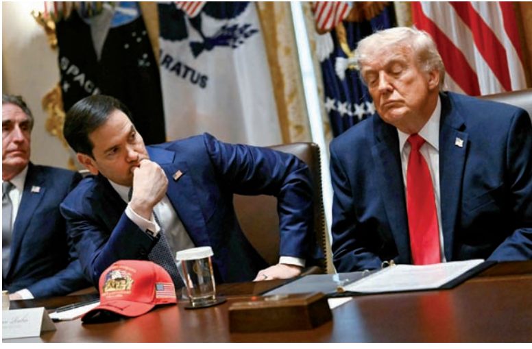
US President Donald Trump with US secretary of Interior Doug Burgum (left) and US Secretary of State Marco Rubio during a cabinet meeting in the Cabinet Room of the White House in Washington, DC, recently.

He said that “no money will be exchanged, until further notice,” possibly a reference to calls by Iran for the US to release the country’s frozen assets.