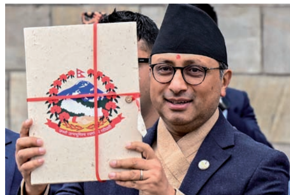
Nepal's Finance Minister Swarnim Wagle poses for photographs as he arrives to present the annual budget at the parliament in Kathmandu yesterday.

Poor planning and sluggish bureaucracy hampered the country's growth in previous years, with the government routinely failing to spend