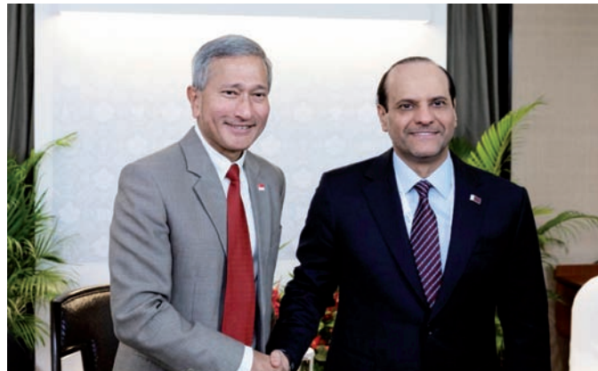
Deputy Prime Minister and Minister of State for Defense Affairs H E Sheikh Saoud bin Abdulrahman Al-Thani meeting Singapore's Foreign Minister H E Dr. Vivian Balakrishnan. RIGHT: The Deputy Prime Minister meeting Malaysia's Minister of Defense H E Mohamed Khaled bin Nordin.

Prime Minister and Minister of Foreign Affairs H E Sheikh Mohammed bin Abdulrahman bin Jassim Al-Thani also sent a cable of condolences to Premier of the State Council of the People's Republic of China H E Li Qiang, over the victims of the coal mine explosion in northern China, wishing the injured a speedy recovery. — QNA