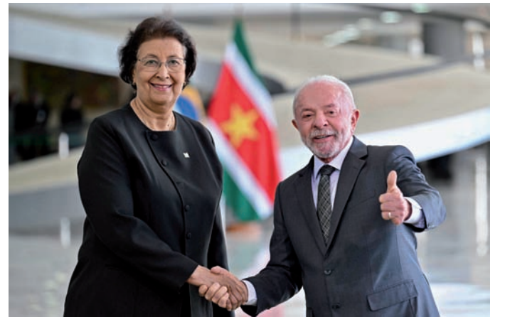
Suriname President Jennifer Geerlings-Simons (left) and Brazil President Luiz Inacio Lula da Silva shake hands during a meeting at Planalto Palace in Brasilia, on May 28, 2025.

“They are terrorists because they torment families, they torment neighborhoods, and