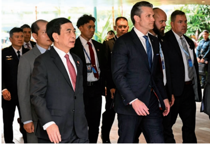
Vietnam's Defence Minister Phan Van Giang) and US Defense Secretary Pete Hegseth walk to a bilateral meeting on the sidelines of the Shangri-La Dialogue Summit in Singapore yesterday.

Vietnamese leader To Lam called on countries to make such talks "truly effective instruments of risk reduction",