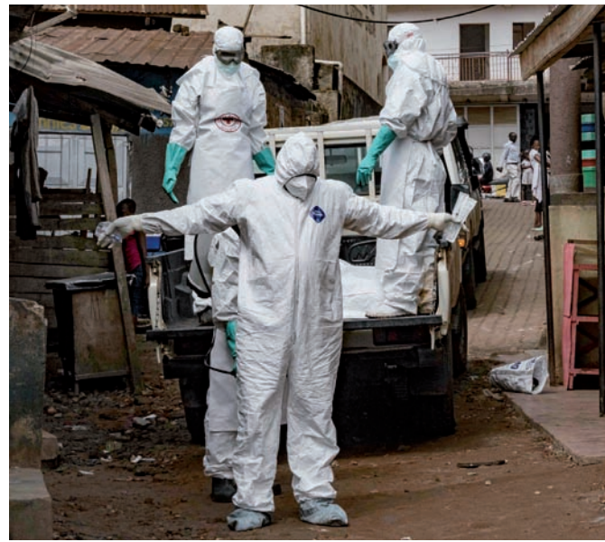
A worker is sprayed with disinfectant during the evacuation of the body of a suspected Ebola victim in Kampala on May 26, 2026. (AFP)

No vaccine or treatment exists for the Bundibugyo strain of Ebola, which is responsible for the current outbreak. — AFP