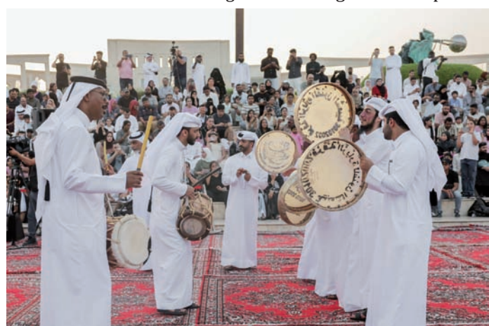
Artists performing during the celebrations.

character that reflected the spirit and diversity of the occasion.