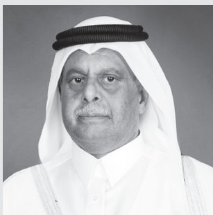
contributions played a prominent role in Qatar's journey of