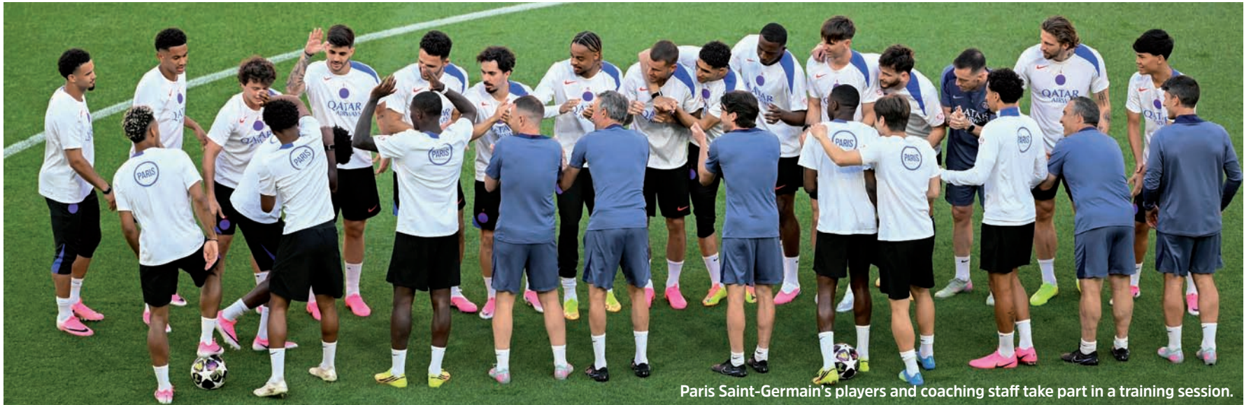
Paris Saint-Germain's players and coaching staff take part in a training session.

Ballon d'Or winner Ousmane Dembele, likely to be fit after a calf problem, Khvicha Kvaratskhelia and Desire Doue lead a