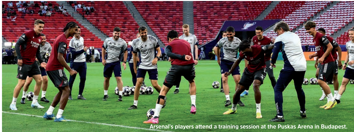
Arsenal's players attend a training session at the Puskas Arena in Budapest.

"Paris Saint-Germain have the experience of knowing what it is to win it." The Frenchman finished as a runner-up with Arsenal in 2006, but later won the trophy elsewhere, with Barcelona in 2009. — AFP