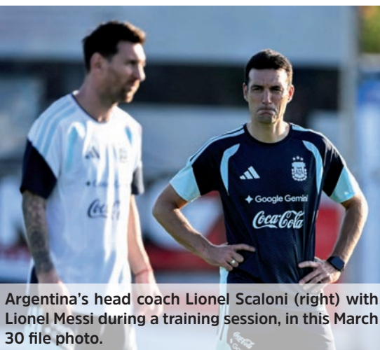
Argentina's head coach Lionel Scaloni (right) with Lionel Messi during a training session, in this March 30 file photo.

The Major League Soccer club had provided no clear timetable for Messi's return after his abrupt exit from Miami's