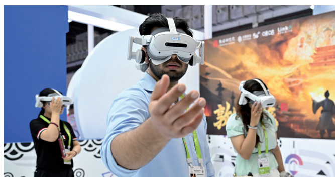
People learn about a VR device during the sixth China International Consumer Products Expo in Haikou, South China's Hainan Province.

Russia and Bulgaria are among nations setting up national pavilions for the first time, while official delegations from 12 countries and regions, including Switzerland, the Czech Republic and Ireland, are attending the event.