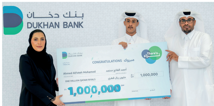
A Dukhan Bank official with the winner of the Thara'a campaign.

To enter the draws, customers must open a Thara'a Savings Account via the Dukhan Bank website, mobile app, or any branch. For more information, customers may call 800 8555.