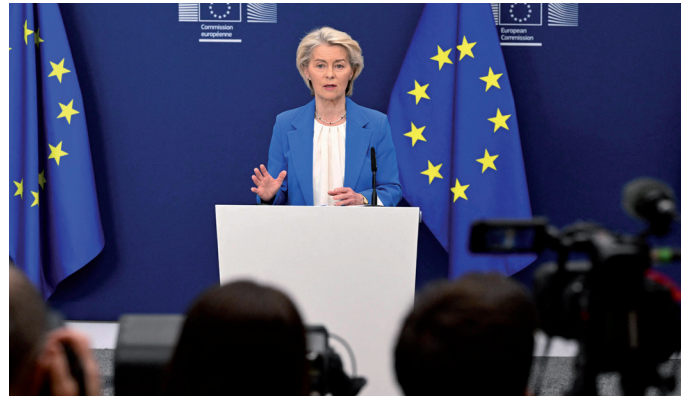
European Commission President Ursula von der Leyen gives a press conference at the EU Commission headquarters in Brussels yesterday.

To address the cost crunch, the commission is considering relaxing its state aid rules to give member states more space to support the "most exposed sectors", von der Leyen said.