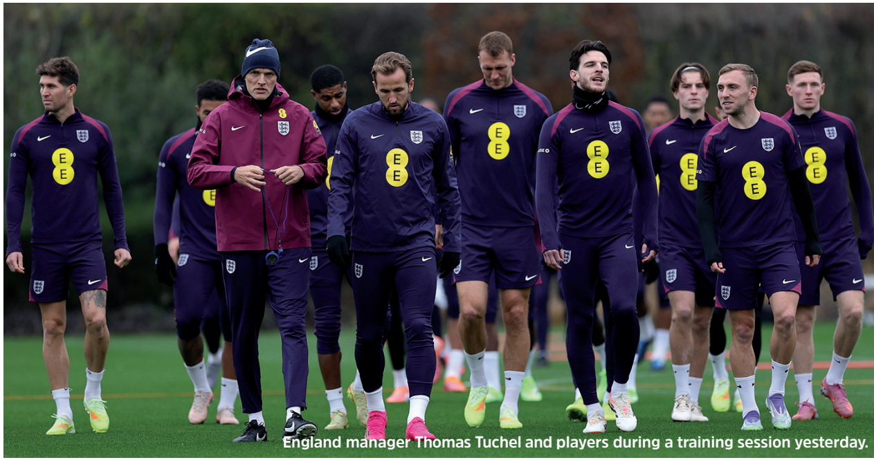
England manager Thomas Tuchel and players during a training session yesterday.

Others will then be released to slim the squad down to around 22 outfield players.