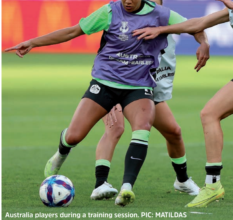
Australia players during a training session.

Dubbed the golden generation by Australian media, finally winning a trophy together would be a dream come true for the likes of Arsenal defender Steph Catley and Chelsea's Ellie Carpenter.