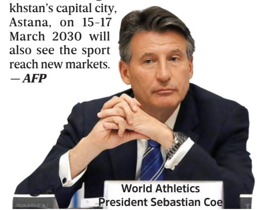
World Athletics President Sebastian Coe

The awarding of the 2030 edition to Kazakhstan's capital city, Astana, on 15-17 March 2030 will also see the sport reach new markets. — AFP