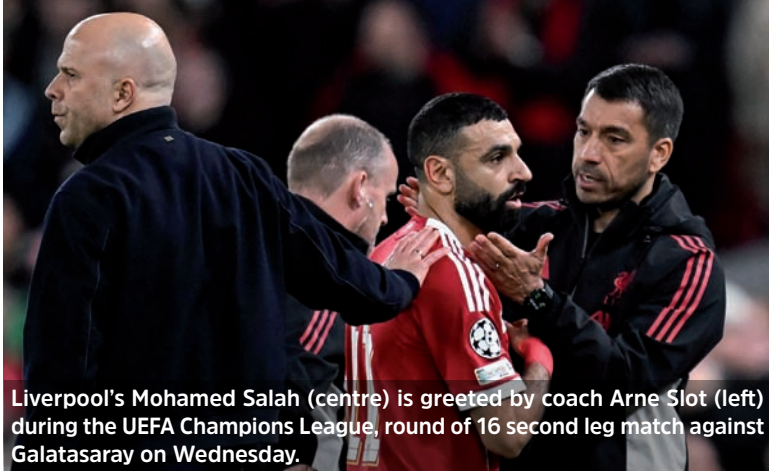
Liverpool's Mohamed Salah (centre) is greeted by coach Arne Slot (left) during the UEFA Champions League, round of 16 second leg match against Galatasaray on Wednesday.

"The good thing for Liverpool and for us is that we go to an international break," he said. "The bad thing for Egypt is that he can't go there.