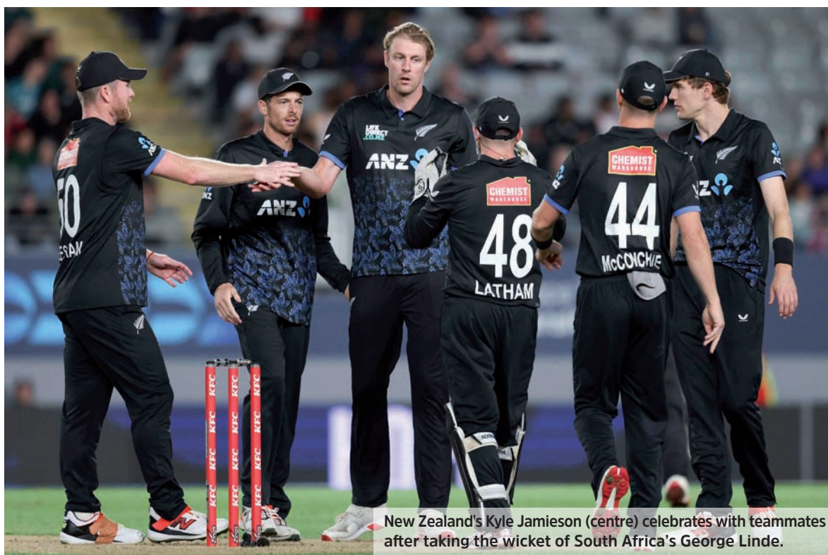
New Zealand's Kyle Jamieson (centre) celebrates with teammates after taking the wicket of South Africa's George Linde.