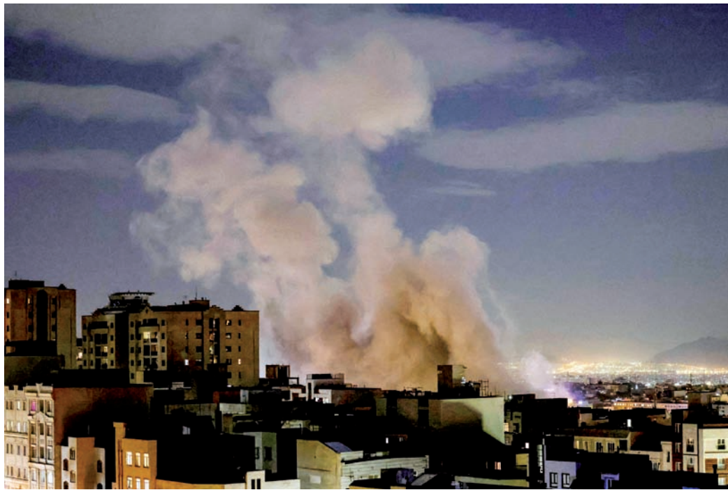
A smoke plume rises following a missile strike on a building in Tehran yesterday.

As crowds demanded revenge — and Iran's army announced strikes targeting US