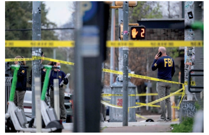
Members of the FBI perform an investigation near Buford's club in downtown yesterday in Austin, Texas.

"Nobody can believe the success we're having, 48 leaders are gone in one shot. And it's moving along rapidly," Trump was quoted as saying in an interview by Fox News. — AFP