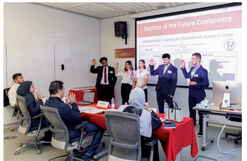
High school students present their research project to a panel of WCM-Q judges. The contest is part of WCM-Q's Doctors of the Future Conference.

In total, 38 schools took part. Participating schools from Qatar were Al Arqam Academy for Girls, Al Manar International School, American School of Doha, Belgravia High School, Birla Public School, DPS - Modern Indian School, Doha British School - Ain Khaled, Doha College, Edison International Academy, Education City High School (two branches), GEMS American Academy - Qatar, Hamilton International School, International School for Medical Science and Engineering, Mesaieed International School, Newton British Academy - Barwa City, Newton International