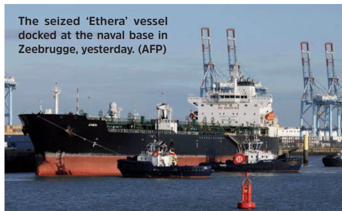
The seized 'Ethera' vessel docked at the naval base in Zeebrugge, yesterday.

Rodriguez, who was vice president under Maduro, was accepted by Trump as Maduro's replacement on condition she submit to Washington demands for access to Venezuelan oil. — AFP