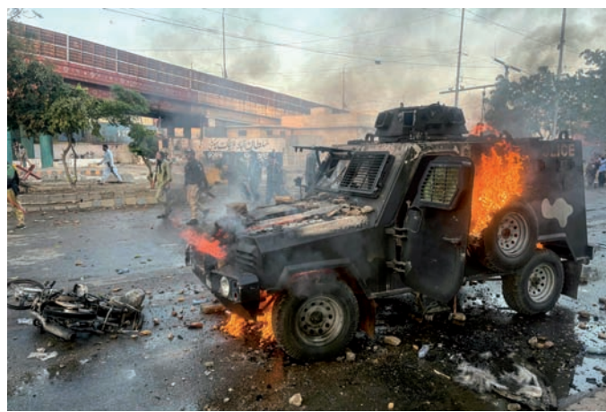
Policemen walk past a burning armoured vehicle set on fire by protestors outside the US consulate in Karachi, yesterday.

In Indian-administered Kashmir, several thousand Muslims joined street demonstrations in the main city Srinagar.