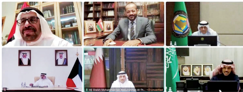
Prime Minister and Minister of Foreign Affairs H E Sheikh Mohammed bin Abdulrahman bin Jassim Al-Thani with Their Excellencies the Ministers of Foreign Affairs of GCC countries and GCC Secretary-General during an extraordinary meeting of the GCC Ministerial Council held virtually yesterday.

The Council stressed the urgent need to immediately stop these attacks to restore security, peace, and stability in the region.