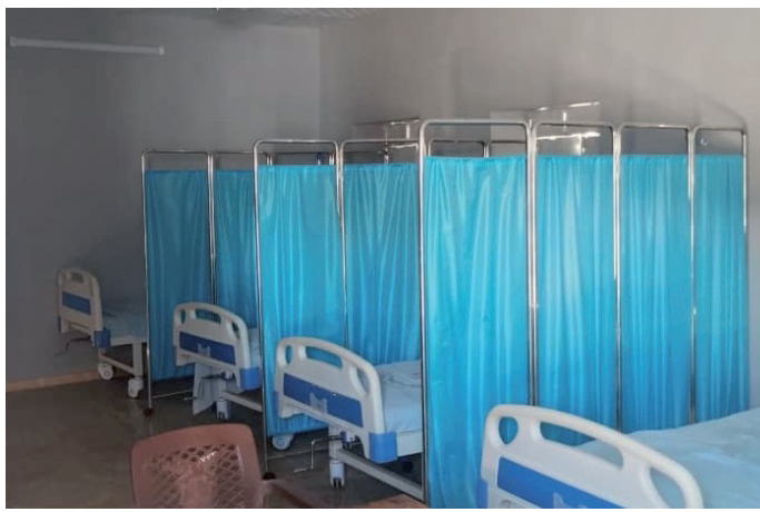
Jabalab Health Centre after completion of rehabilitation work.

As part of the project, the centre was fully furnished with office furniture, chairs, cabinets, and medical hospital beds, which would increase operationality and enable health care providers to better