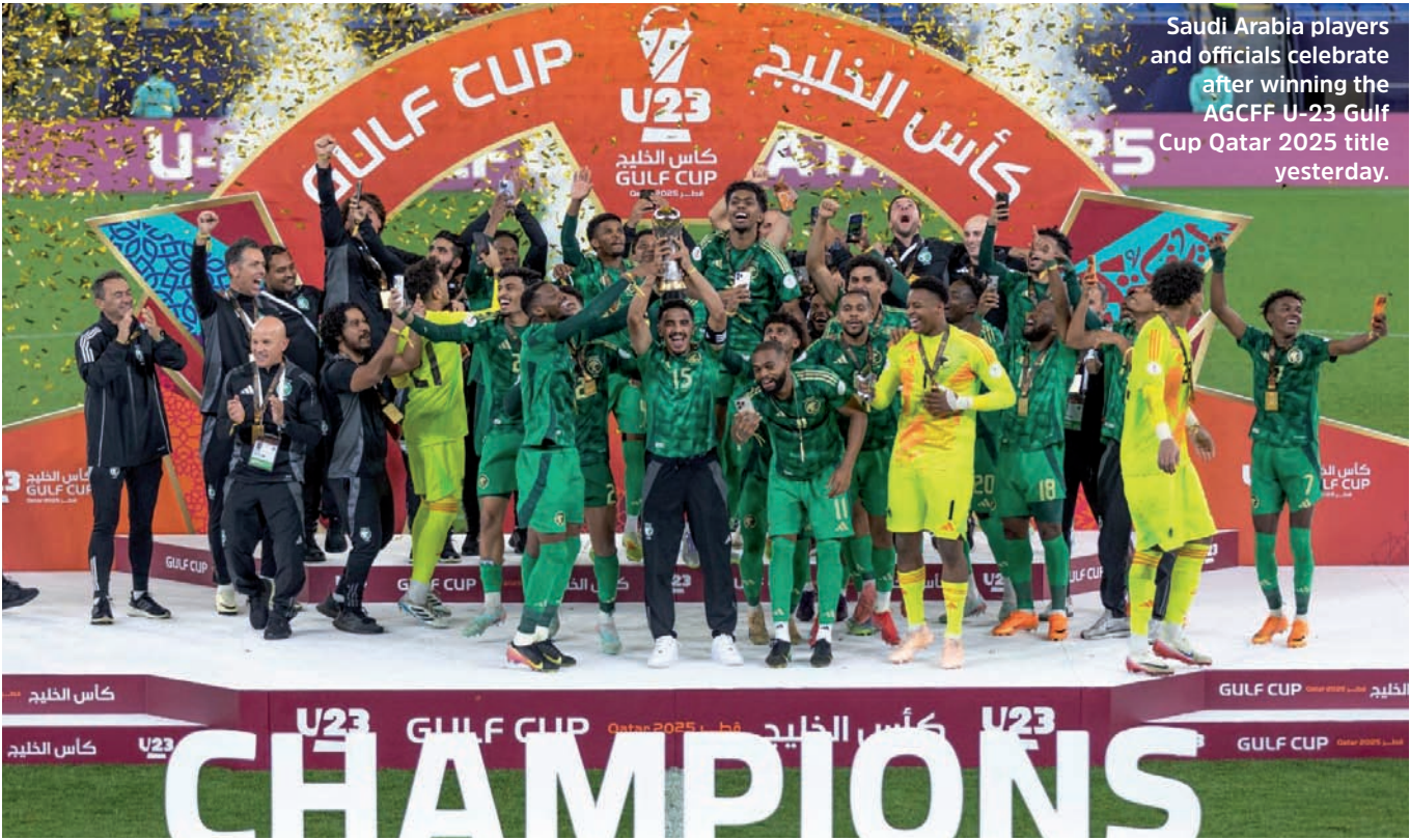
Saudi Arabia players and officials celebrate after winning the AGCFF U-23 Gulf Cup Qatar 2025 title yesterday.

DOHA: Saudi Arabia have been crowned champions of the AGCFF U-23 Gulf Cup Qatar 2025, after claiming a 2-0 win over Iraq in the final match held at Stadium 974 yesterday. The tournament took place in Qatar from December 4-16, bringing together rising U-23 football stars from across the region to compete for the prestigious title. This was the first time that the competition was held under the auspices of the Arab Gulf Cup Football Federation (AGCFF). "The U-23 Gulf Cup is part of a thrilling football season in the country, with Qatar making history by hosting numerous tournaments consecutively." "The successful delivery of this tournament once again showcased Qatar's commitment towards supporting emerging football talents from the region, while uniting fans to celebrate