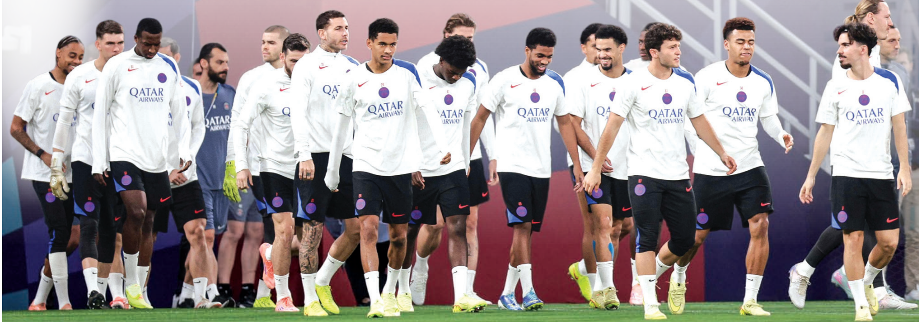
Paris Saint-Germain's players attend a training session on the eve of their 2025 FIFA Intercontinental Cup final against CR Flamengo.