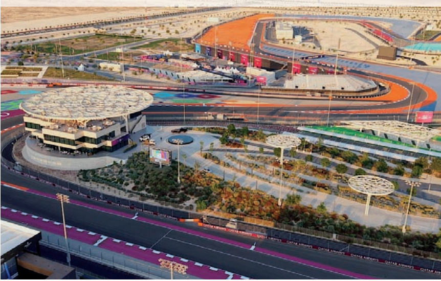
The 2025 Formula 1 Qatar Airways Qatar Grand Prix prominently featured sustainability, accessibility and community engagement.

central with a 1.23 megawatt rooftop solar array producing 3 million kilowatt hours annually, solar powered lights for paths and parking, and hybrid generators for powering the event. The circuit's fleet followed suit by predominantly using electric vehicles, including buggies, fan shuttles, operational vehicles, waste trucks, and forklifts, supported by four EV charging stations. Additionally, 100% of the shuttles operating between the Metro station and the circuit were electric. In the FanZone, a dedicated sensory room provided a calm space for visitors with diverse learning needs, while for the first time in F1, a commentary booth was adapted to offer families with specific needs comfortable seating and prime track views. A customized pit walk further extended this inclusivity, engaging about 25 students with additional learning needs in a guided exploration of the garages. Community involvement also reached new heights during the Grand Prix, as 665 volunteers from 107 nationalities, 66% male and 34% female, played key roles in operations. The Sustainability Volunteers Team engaged fans in interactive activities to promote eco-responsibility. Initiatives included guiding waste disposal, "Guess the Right Bin" games, and demonstrations on recyclables versus