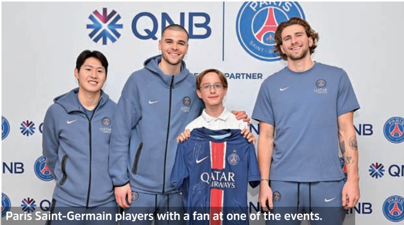
Paris Saint-Germain players with a fan at one of the events.