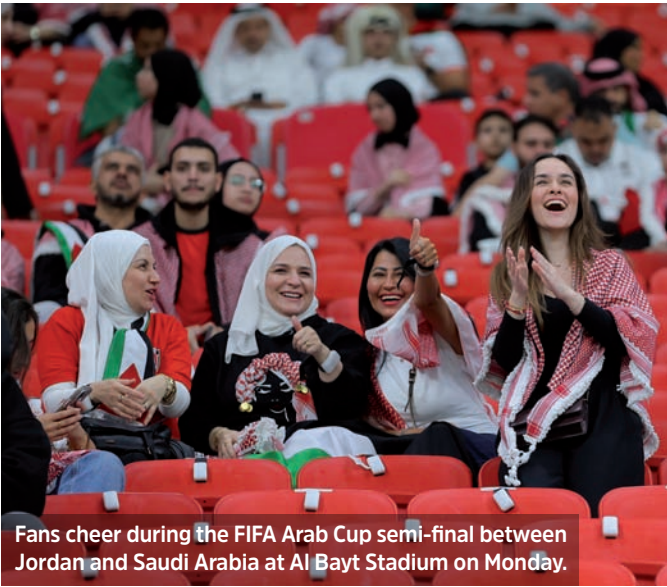
Fans cheer during the FIFA Arab Cup semi-final between Jordan and Saudi Arabia at Al Bayt Stadium on Monday.