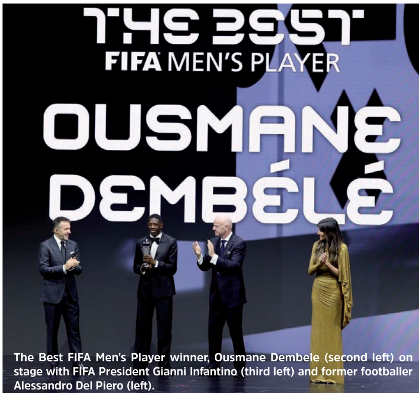
The Best FIFA Men's Player winner, Ousmane Dembele (second left) on stage with FIFA President Gianni Infantino (third left) and former footballer Alessandro Del Piero (left).

At 27, Alexia Bonmati was crowned Women's Player of the Year for the third consecutive time, following her