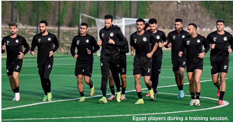
Egypt players during a training session.

In Group C, Jordan are leading with six points, Egypt have two points while UAE and Kuwait have one point each. Egypt will qualify with a win, and a draw could also