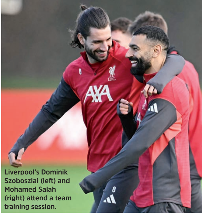
Liverpool's Dominik Szoboszlai (left) and Mohamed Salah (right) attend a team training session.

He is the club's highest-paid player in history, having signed a new contract in April, and played a key role in Liverpool's two Premier League titles and one Champions