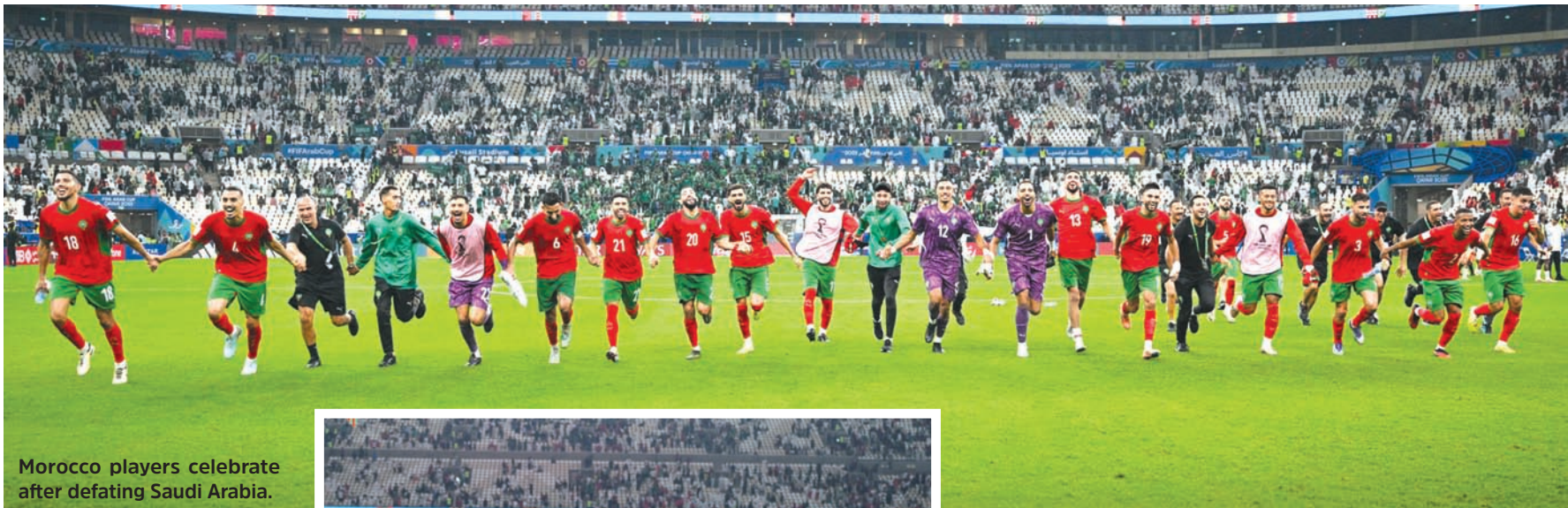
Morocco players celebrate after defeating Saudi Arabia.

"We faced a well-organised team and took advantage of their defensive mistakes. We're pleased to have secured a spot in the quarter-finals, especially