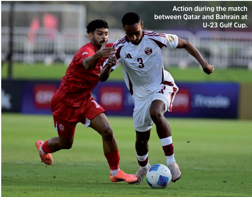
Action during the match between Qatar and Bahrain at U-23 Gulf Cup.