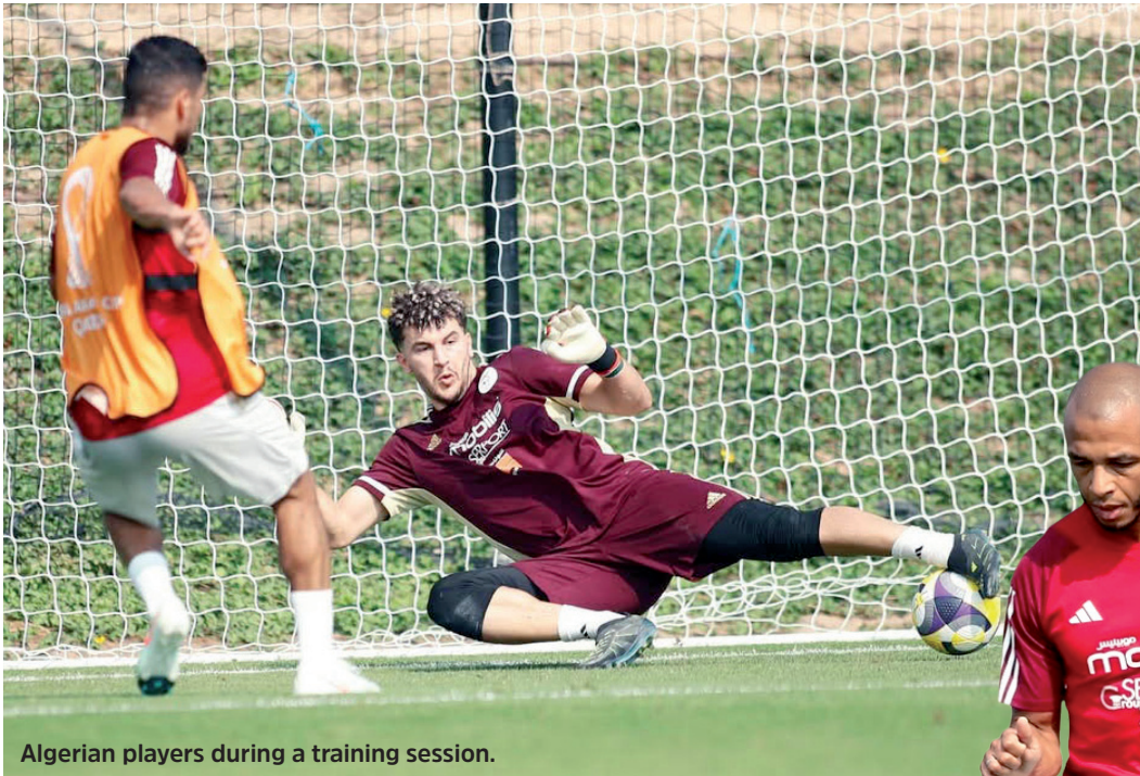
Algerian players during a training session.

also expressed confidence ahead of the clash.