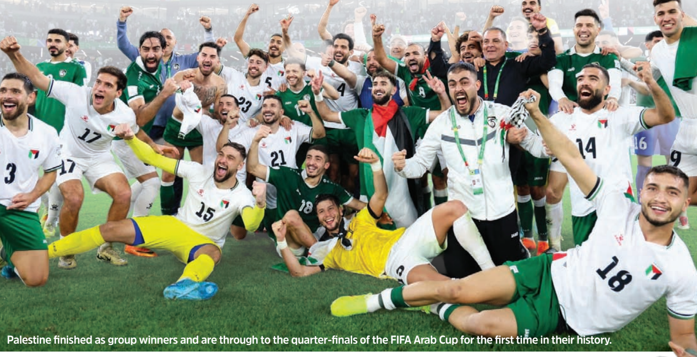
Palestine finished as group winners and are through to the quarter-finals of the FIFA Arab Cup for the first time in their history.

The next challenge for the Lions of Canaan will come in the last eight, with that match to be played on Thursday in Lusail. (FIFA)