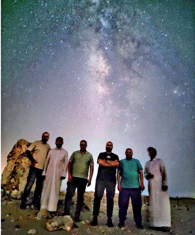
Qatar Calendar House astronomical team and astrophotographers under the Milky Way.