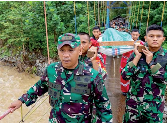
Members of a rescue team carry a survivor of the landslide at Tulabolo village in Bone Bolango Regency of the Gorontalo Province.

houses in five villages in Bone Bolango, which is part of a mountainous district in Gorontalo province. Nearly 300 houses were affected and more than 1,000 people fled for safety. Authorities deployed more than 200 rescuers, including police and military personnel, with heavy equipment to search for the dead and missing in a rescue operation that has been hampered by heavy rains, unstable soil, and rugged, forested terrain, said Afifuddin Ilahude, a local rescue official. “With many missing and some remote areas still unreachable, the death toll is likely to rise,” Ilahude said, adding that sniffer dogs were being mobilized in the search. Videos released by the