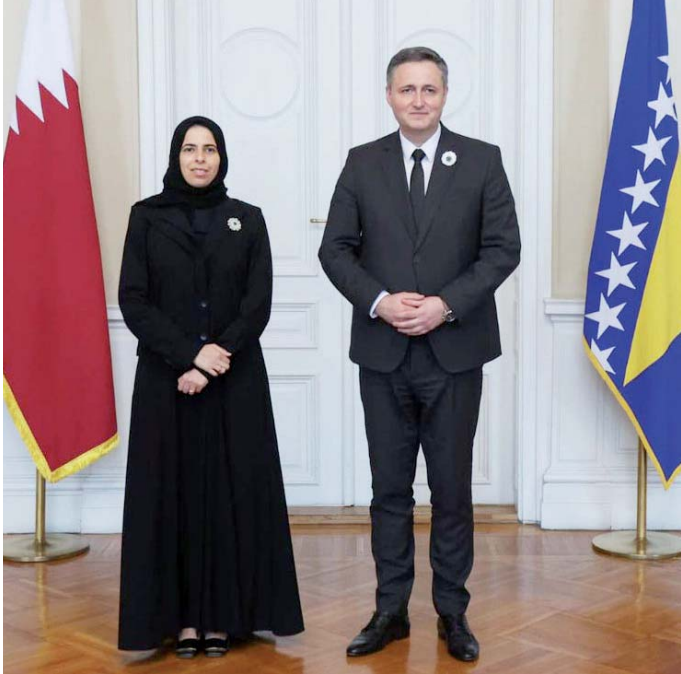
Chairman of the Presidency of Bosnia and Herzegovina H E Denis Becirovic with Minister of State for International Cooperation at the Ministry of Foreign Affairs H E Lolwah bint Rashid Al Khater during the meeting.

enhance them, especially in the field of human rights, in addition to a number of issues of common interest. During the meeting, the Minister of Human Rights and Refugees of Bosnia and Herzegovina expressed his country's aspiration to strengthen joint bilateral cooperation in all fields, especially in the education and development sectors, and praised the role of the State of Qatar and its efforts to achieve ceasefire in Gaza. The Minister of State for International Cooperation at the Ministry of Foreign Affairs received from the Minister of Human Rights and Refugees of Bosnia and Herzegovina the flower of Srebrenica medal, which expresses the desire to show solidarity. Ambassador of the State of Qatar to Bosnia and Herzegovina H E Meshal bin Ali Al Attiyah attended the meeting. — QNA