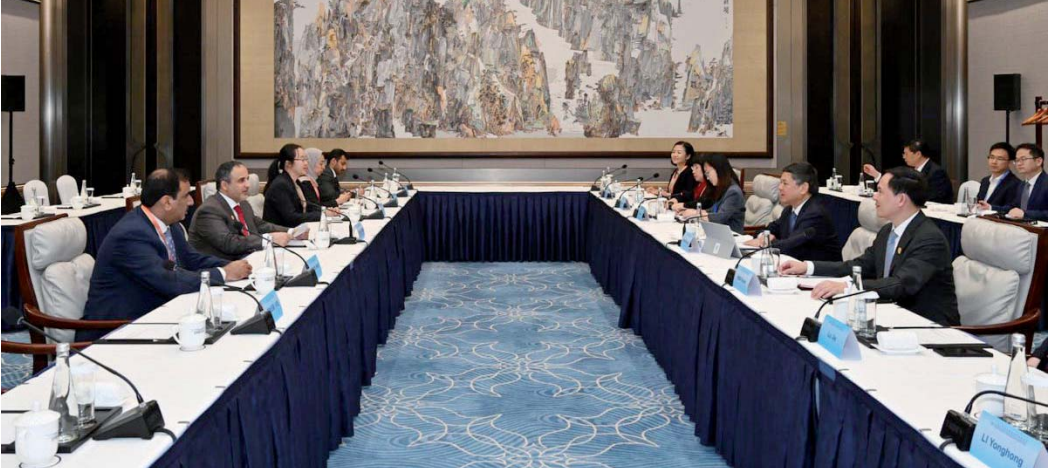
Minister of Environment and Climate Change H E Dr. Abdullah bin Abdulaziz bin Turki Al Subaie meeting Minister of Ecology and Environment of China H E Huang Runqiu on the sidelines of the forum.

third National Development Strategy (2024-2030), which serves as the main catalyst in advancing country's economic diversification while ensuring environmental sustainability. He highlighted that ensuring energy security remains a fundamental global obstacle to development and that Qatar, as a leading global supplier of natural gas, enjoys a distinguished position that qualifies it to assume a major role in global green development and the transition towards a low-carbon future. Qatar also launched the National Renewable Energy Strategy, which aligns with its