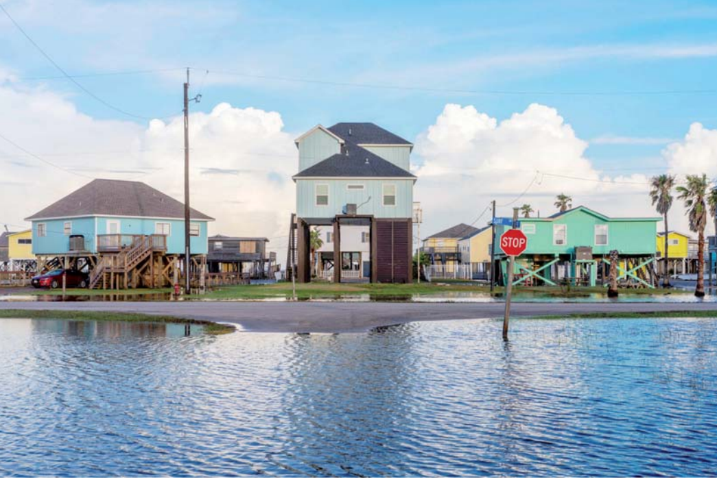
Homes are surrounded in floodwater after Hurricane Beryl swept through the area on July 08, 2024 in Surfside, Texas.

Some 2.6 million households in Texas were without electricity as of Monday evening, according to the poweroutage.us tracker, as temperatures were forecast to climb above 32 degrees Celsius over the next few days. Rose Michalec, 51, told AFP that Beryl blew down fences in her south Houston neighborhood. "For a Category 1 storm, it's quite a bit of damage... It's more than we expected," she said. In downtown Houston, several areas were completely inundated, including the park where 76-year-old Floyd Robinson usually walks. "I'm seeing more of this kind of damaging water, than I've ever seen before," the life-long Houston resident told AFP. "This is just the beginning of July and for us to have a storm of this magnitude is very rare," he added. Along the Texas coastline, AFP journalists saw several waterfront homes and buildings with their roofs torn off by the wind. Several communities in the area had issued voluntary or mandatory evacuation orders ahead of the storm. Meanwhile in the neighboring state of Louisiana, one death was announced by the Bossier Parish sheriff's office, also by a tree falling on a home. The deaths on Monday raise