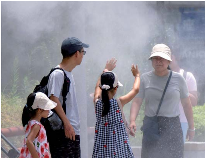
A family cools down under a mist shower during hot weather in central Tokyo yesterday.

TOKYO: Six people have died of heatstroke in Tokyo as Japan swelters under a rare rainy season heatwave, prompting authorities to issue a flurry of health warnings. Over the weekend, the central Shizuoka region became the first in Japan to see the mercury reach 40 degrees Celsius this year, far surpassing the 35-degree threshold classified by weather officials as “extremely hot”. Such severe heat in the middle of Japan’s rainy season is “rather rare”, caused in part by a strong South Pacific high-pressure system, a weather agency official told AFP. Temperatures also hit record highs near 40 degrees Celsius on Monday at observation posts in Tokyo and in the southern Wakayama region, according to local media. The past few days have seen authorities issue heatstroke alerts in much of the country, urging residents to avoid exercising outside and to use air conditioning. The capital logged three deaths linked to heatstroke on Saturday and three more on