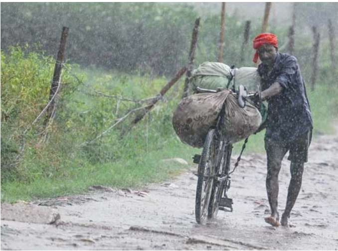
A man pushes his bicycle loaded with vegetables during heavy rainfall in New Delhi yesterday. (AFP)

rhinos as well as scores of deer had been killed in recent days. “Although there is higher ground for the shelter of the animals, the animals suffer when the high floods affect the park,” said a senior park official, who was not authorised to speak to the media, confirming the animal deaths. Kaziranga, a UNESCO world heritage site, is flooded almost every year, helping replenish water supplies and the ecological balance of the park. — AFP