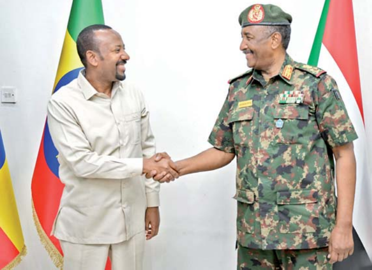
President of Sudan's Transitional Sovereignty Council General Abdel Fattah Al Burhan (right) welcomes Ethiopia's Prime Minister Abiy Ahmed during an official visit in Port Sudan yesterday.

Burhan's army camp has so far largely shunned East African mediation attempts, accusing