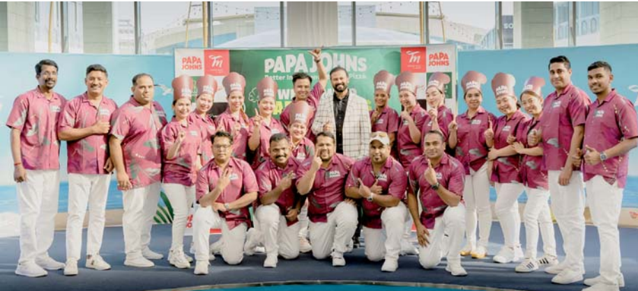
Participants and officials at a Papa John's Pizza Academy event.

process to compete for fantastic prizes. Registration is free and open to all kids. They can sign up online. The event features chef-led demonstrations by experienced Papa John's chefs, creative challenges to spark imagination, and educational insights into ingredients and balanced nutrition. Several partners are involved in the event including Tawar Mall as the venue partner, Tanmiah as the Platinum Partner, Arabian Packaging as the Gold Sponsor, and Radio Mirchi as the Entertainment Partner — all sharing commitment to promoting culinary education and creativity. Participants also get the chance to sample the creations and enjoy delicious Papa John's pizzas. Papa John's Pizza Academy Season 3 kicks off on July 5 at Tawar Mall, at 3:30pm at Papa John's store located at ground floor and it will continue every Friday between 3pm and 6pm at Tawar Mall.