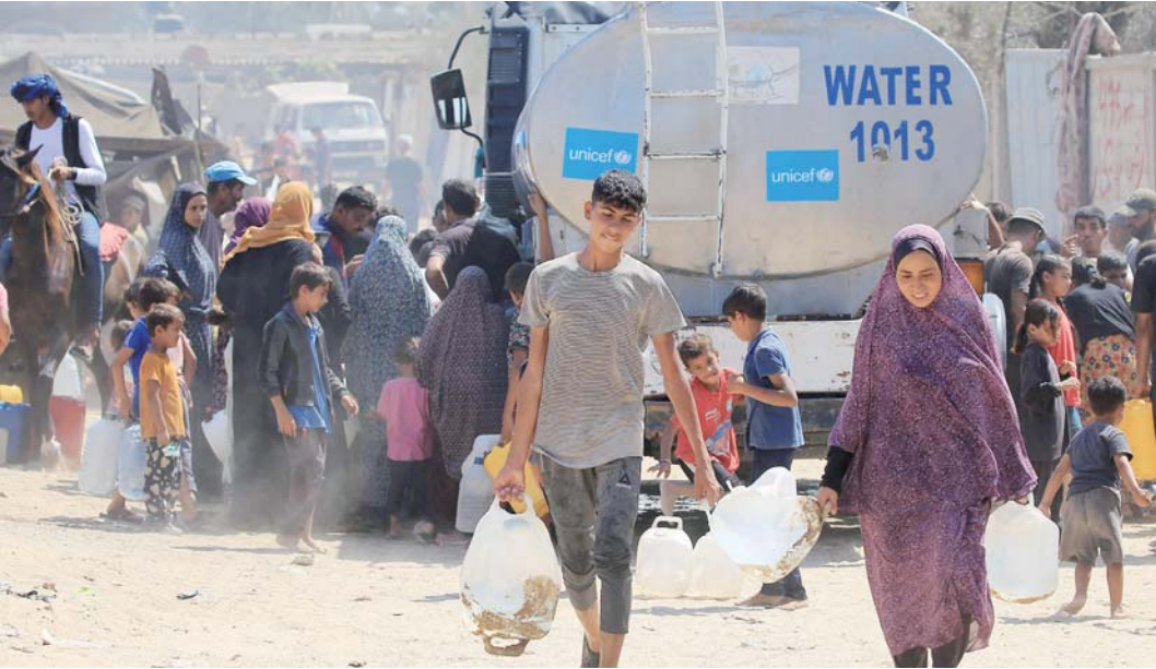
Palestinians collect water from a Unicef tanker in Deir Al Balah in the central Gaza Strip, yesterday, (AFP)

The war started with Hamas's October 7 attack on southern Israel. The fighters seized 251 hostages, 116 of whom remain in Gaza, including 42 the military says are dead.