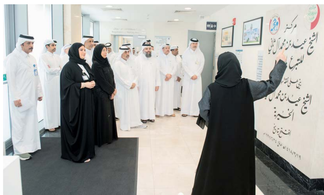
Minister for Public Health H E Dr. Hanan Mohamed Al Kuwari, Minister of State for Interior Affairs H E Sheikh Abdulaziz bin Faisal Al Thani with other dignitaries and officials touring the new Qatar National Blood Donation Center at Hamad Medical Corporation.

Donation Center will be the sole source for the provision of blood and blood components for all governmental and private hospitals in Qatar. The new Center will house 38 blood collection