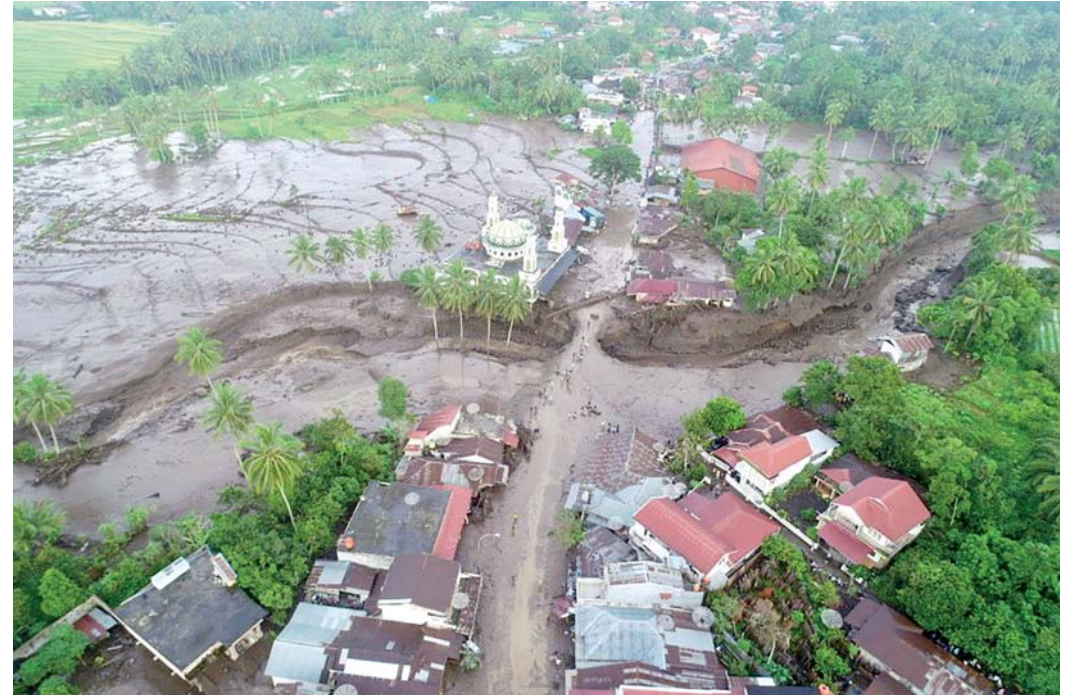
An aerial view of a damaged area after flash floods and the flow of cold lava from a volcano in Tanah Datar, West Sumatra, yesterday.

of a three-year-old and an eight-year-old, were identified yesterday, Malik said in an earlier statement.