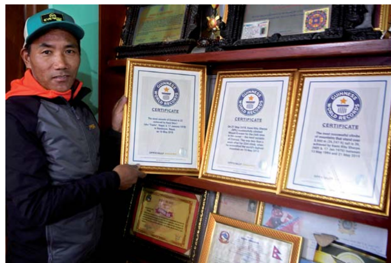
Nepal's mountaineer Kami Rita Sherpa poses along with his certificates in his rented room at Boudhanath Stupa area on the outskirts of Kathmandu on January 19, 2021.