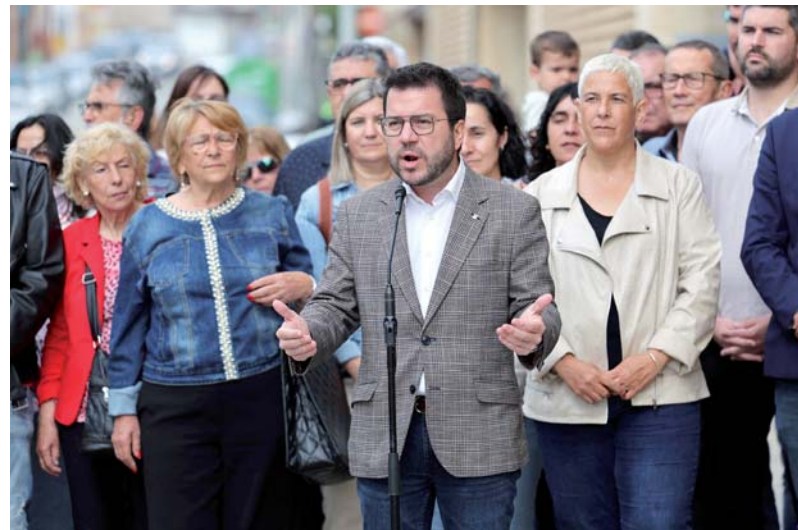
Supporters applaud as Catalonia's regional President Pere Aragonés gives a press conference after voting during Catalonia's regional elections in Pineda, yesterday.

pro-independence have not had enough of a voice or representation so I hope that can change." — High-stakes election — For Sanchez, seizing Catalonia from the separatists would be a major victory in his efforts to turn the page on the crisis sparked by the secession bid.