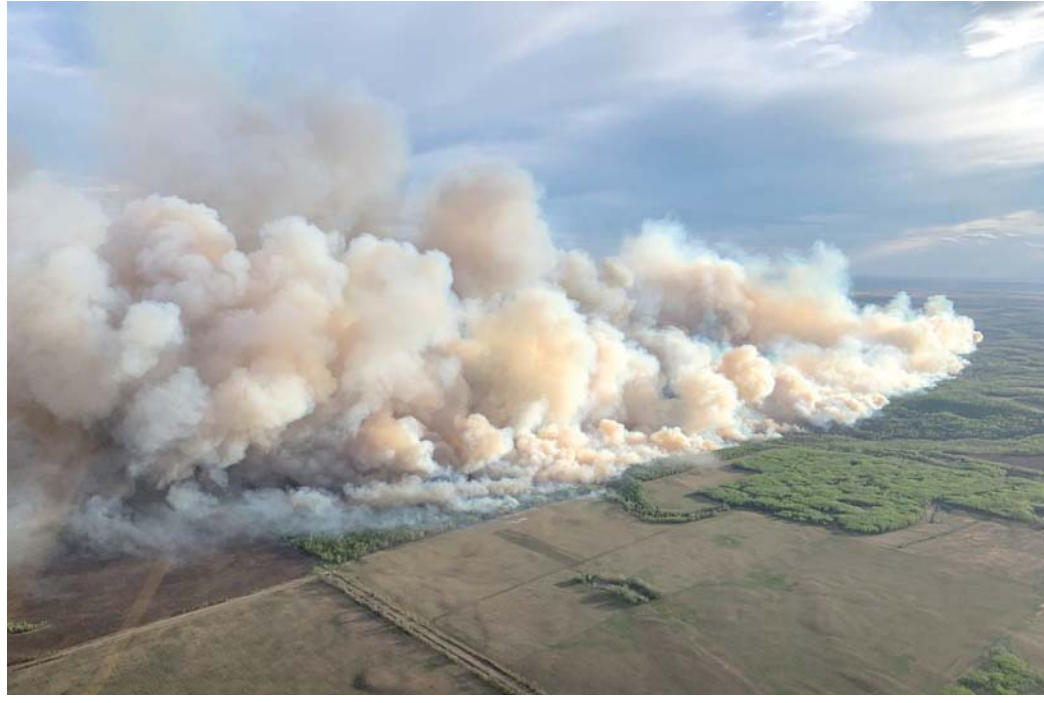
Smoke from wildfires burning in the Grande prairie forest area, 4km east of the town of Teepee Creek, in Alberta, Canada.

Meteorologists are not anticipating rain and have