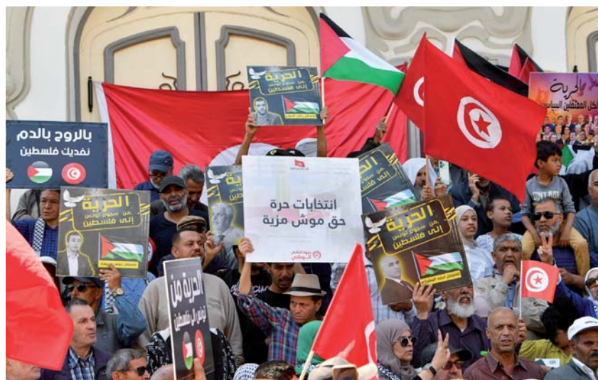
Demonstrators chant slogans at a rally organised by the National Salvation Front opposition alliance in Tunisia yesterday.

"These actions are taken to protect freedom of navigation and make international waters safer and more secure for US, coalition, and merchant vessels," CENTCOM added. — QNA