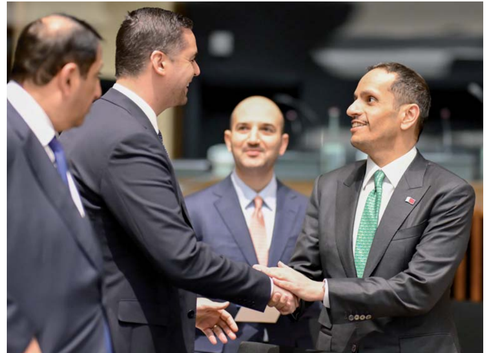
Prime Minister and Minister of Foreign Affairs H E Sheikh Mohammed bin Abdulrahman bin Jassim Al Thani shakes hands with Malta's Minister of Foreign and European Affairs and Trade Hon. Dr. Ian Borg, during the EU-GCC High Level Forum held in Luxembourg on April 22, 2024.

In this complex time, the State of Qatar has continued to position itself as a pivotal mediator in regional and international conflicts, leveraging its diplomatic prowess and strategic position in the Middle East and beyond. We commend Qatar's role in resolving disputes through peaceful means and fostering dialogue as well as Qatar's efforts to prevent