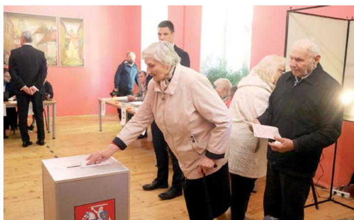
Voters cast their ballots during the first round of Lithuania's presidential election in a polling station in Vilnius, yesterday.

The Lithuanian government wanted to exclude monitors from Russia and Belarus, accusing the two nations — both members of the 57-member organization — of being threats to its political and electoral processes. — AP