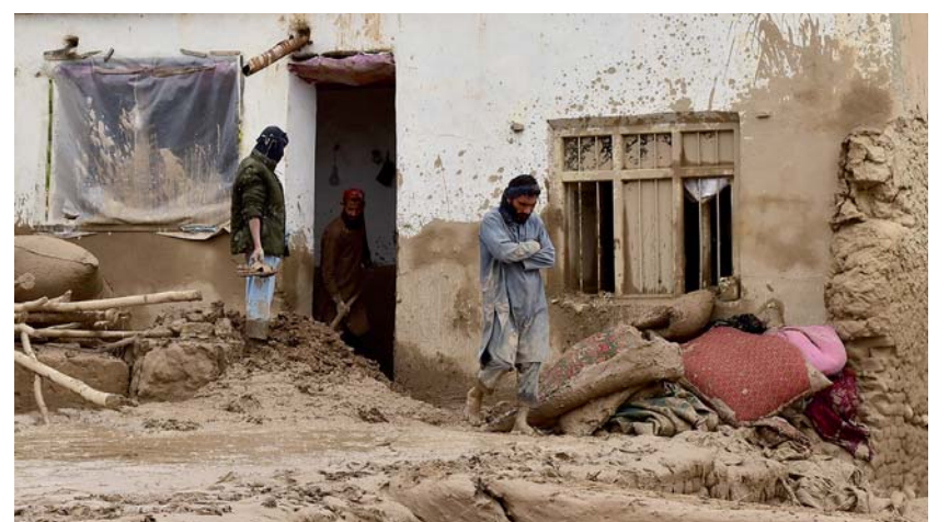
Afghan men clear debris and mud from a damaged house following a flash flood after a heavy rainfall in Laqiha village of Baghlan-i-Markazi district in Baghlan province on May 11, 2024.

So far this year, "nearly 13,000 people in Afghanistan have been impacted by disasters caused by extreme weather, including floods and