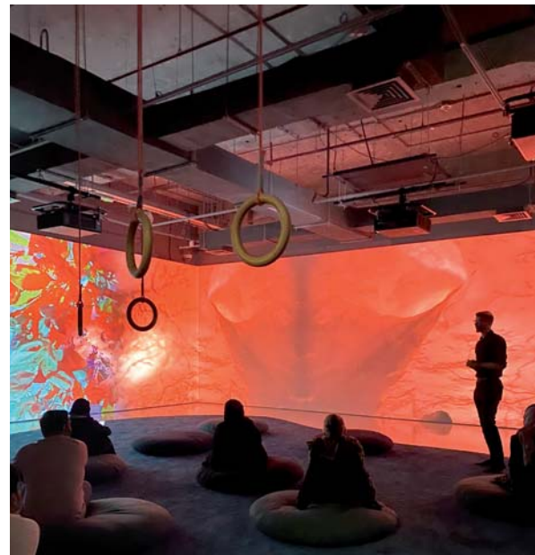
"We Are Family" forms part of the exhibition's educational programme, centred around the theme of family values and ethical commitment.